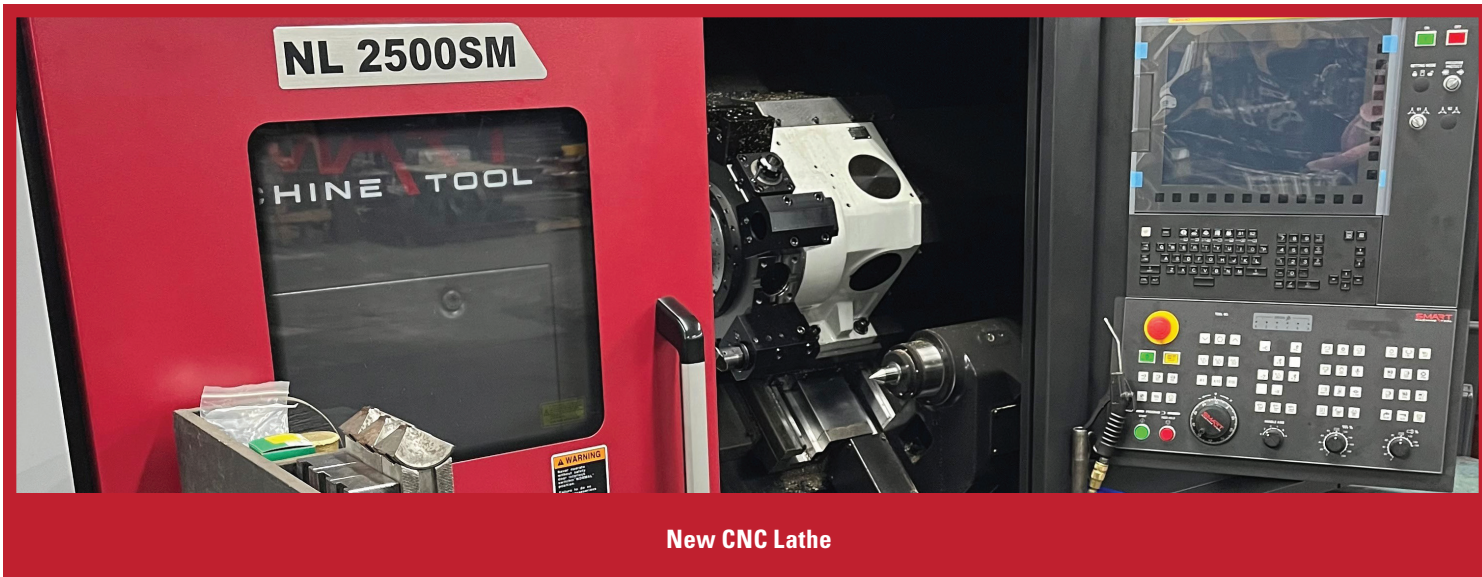
New CNC Lathe