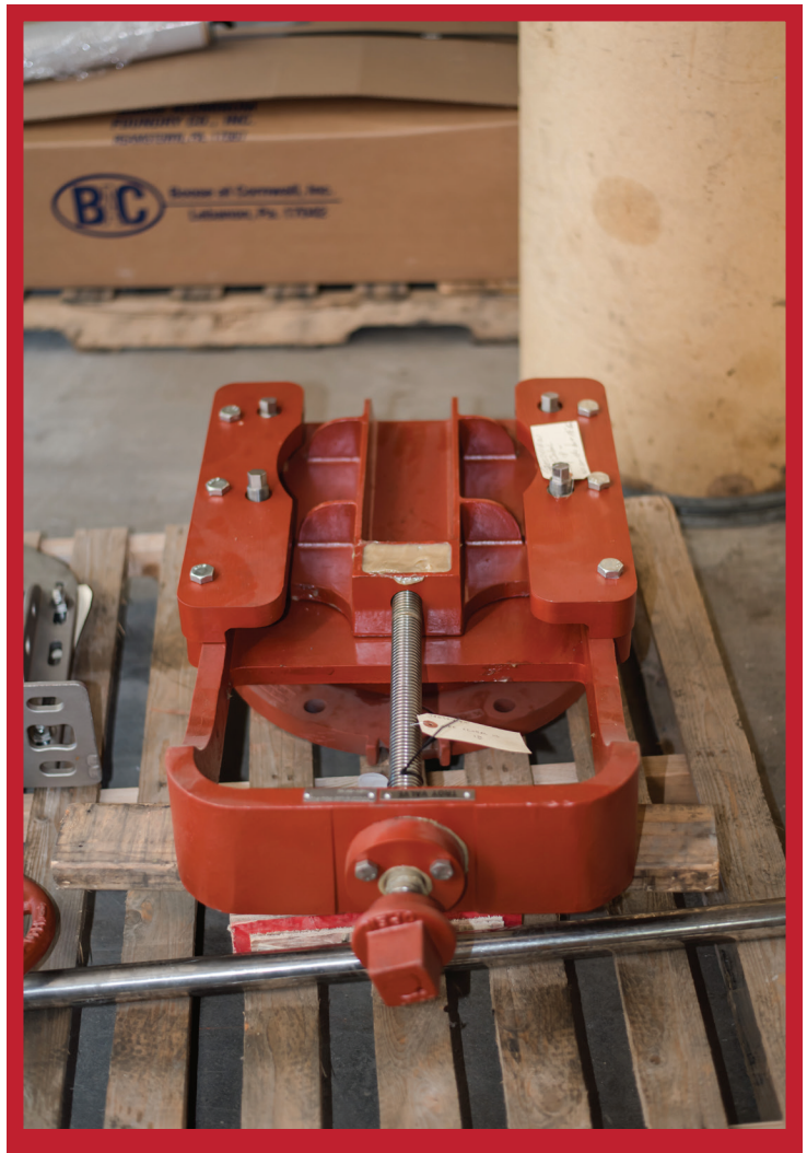
12" Sluice Gate