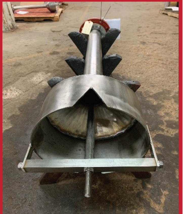
A telescoping valve slip tube with cone in process