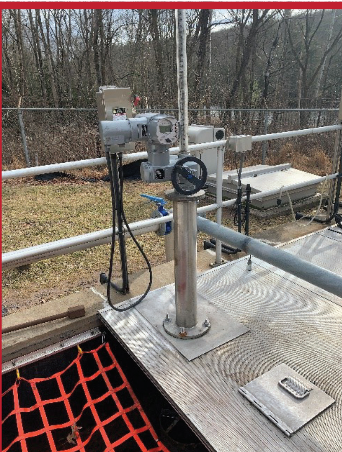
An actuated telescoping valve installation