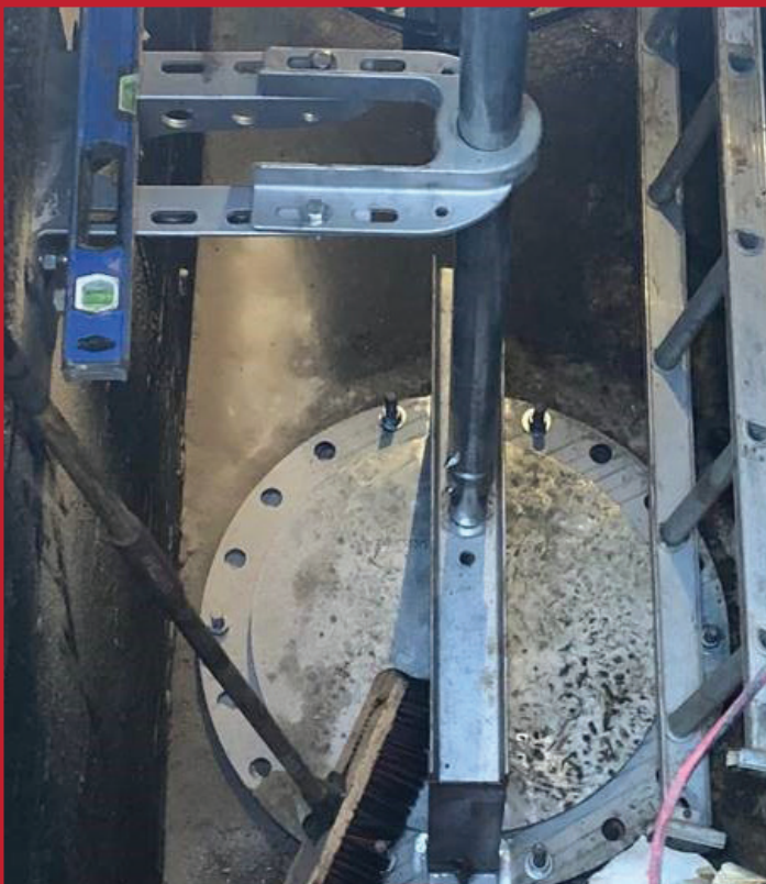
A fabricated mud valve installation