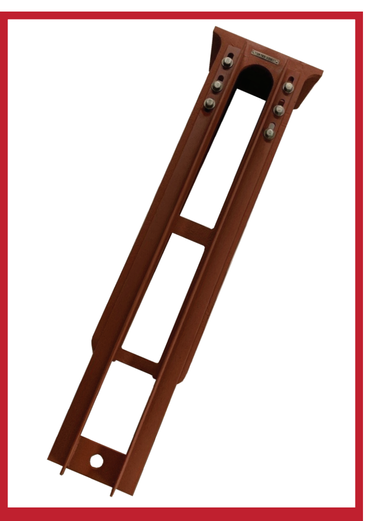
An Example Of An Extended Reach Stem Guide