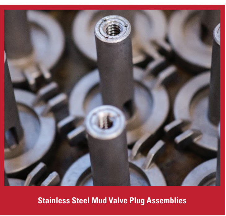
PENN-TROY MANUFACTURING INC. MANUFACTURING TRUST.