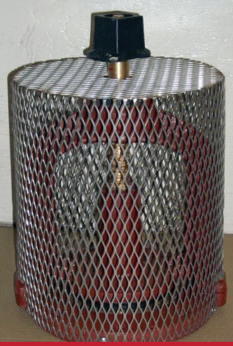
Cast Iron Mud valves with custom mesh cages as a special request