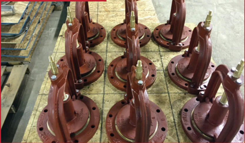
Just a few of our Non Rising stem Mud Valves in inventory