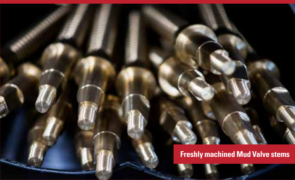
Freshly machined Mud Valve stems