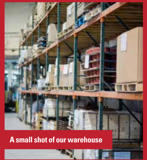
A small shot of our warehouse