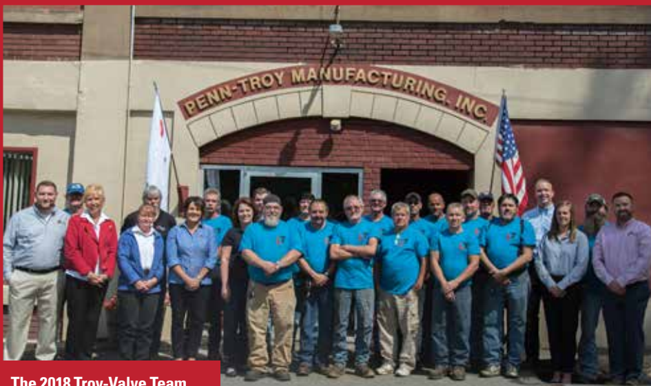
The 2018 Troy-Valve Team