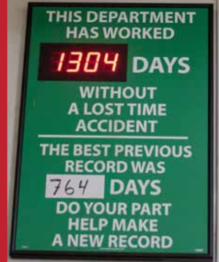
Evidence of our excellent safety record