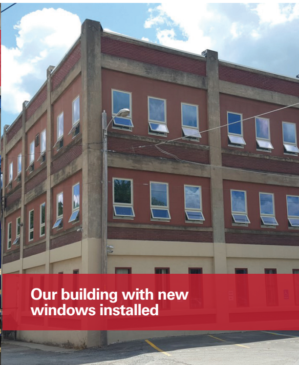
Our building with new windows installed