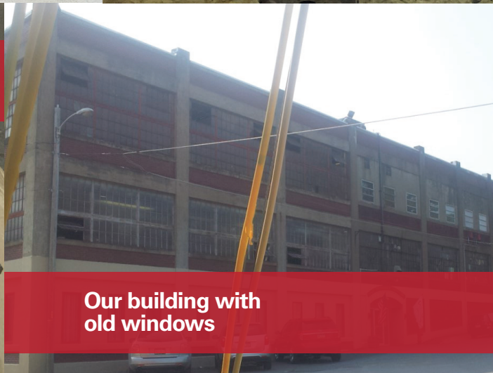
Our building with old windows