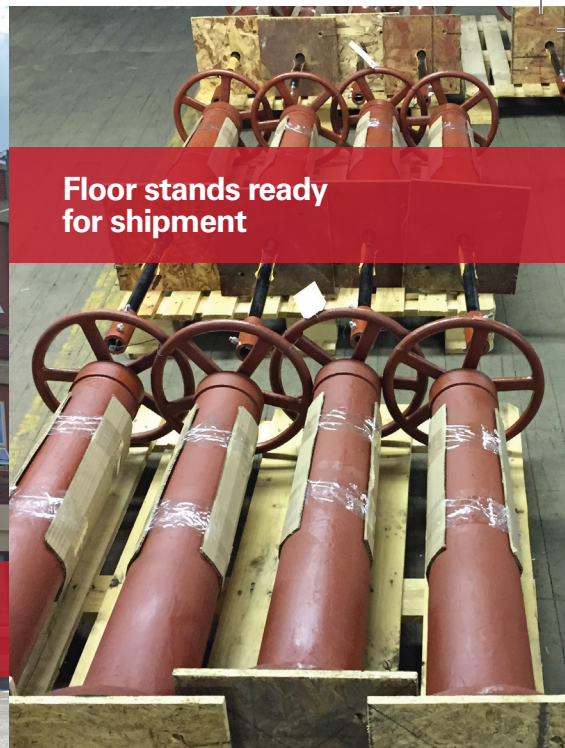
Floor stands ready for shipment