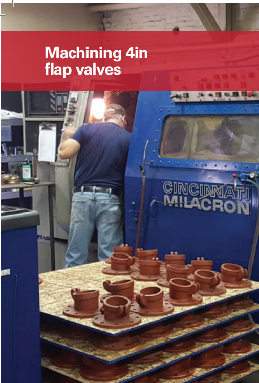
Machining 4in flap valves