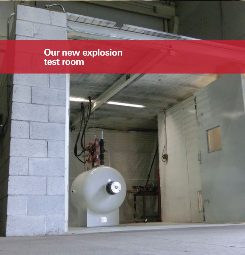
Our new explosion test room