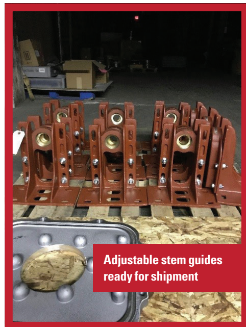
Adjustable stem guides ready for shipment