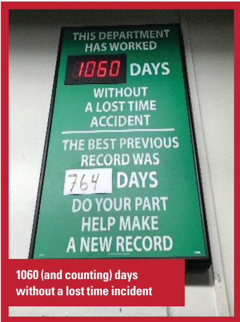
1060 (and counting) days without a lost time incident