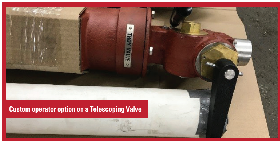
Custom operator option on a Telescoping Valve