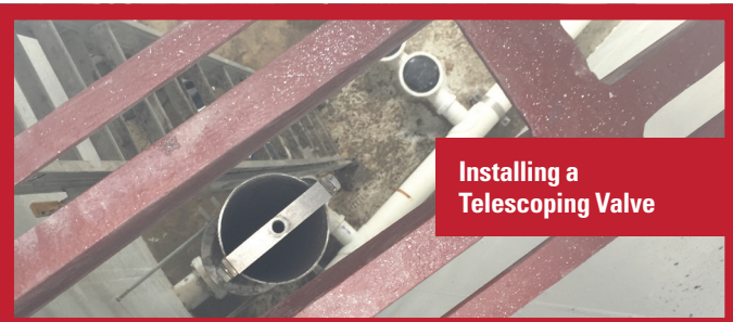
Installing a Telescoping Valve