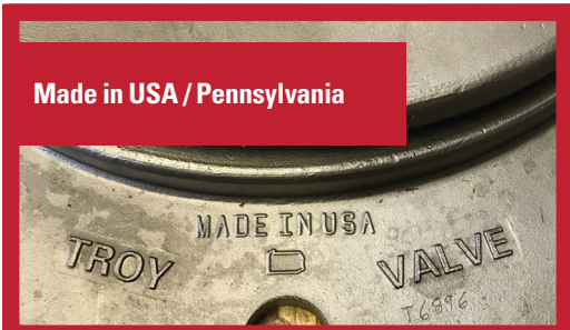
Made in USA / Pennsylvania