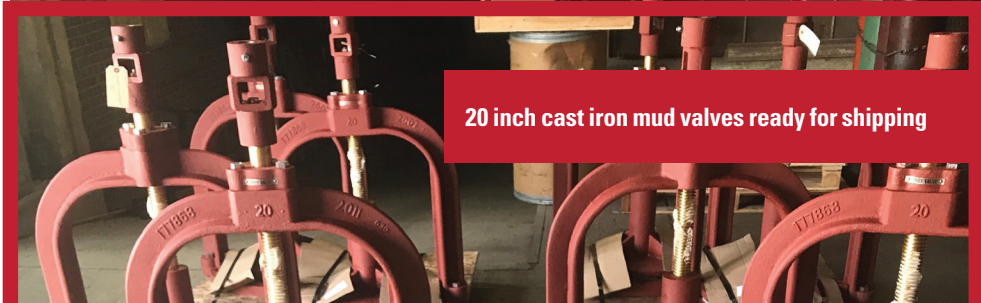
20 inch cast iron mud valves ready for shipping