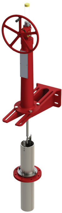
Bracket mounted Rack & Pinion Telescoping Valve rendering