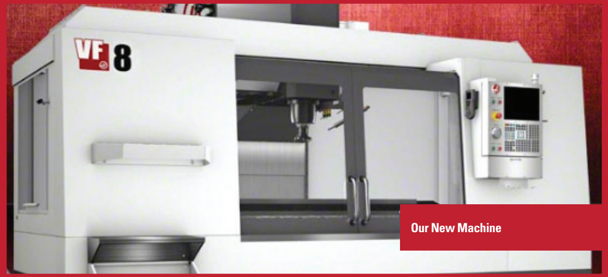
Our New Machine