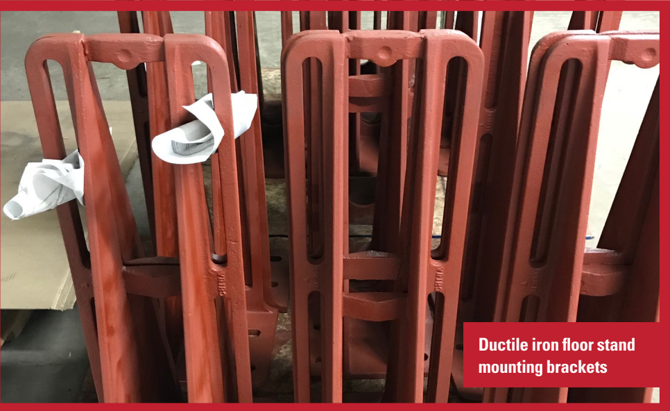
Ductile iron floor stand mounting brackets