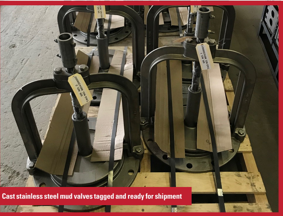
Cast stainless steel mud valves tagged and ready for shipment