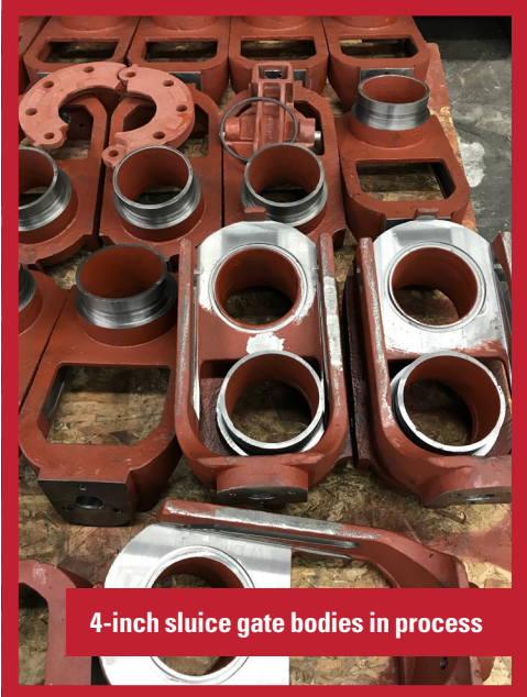
4-inch sluce gate bodies in process