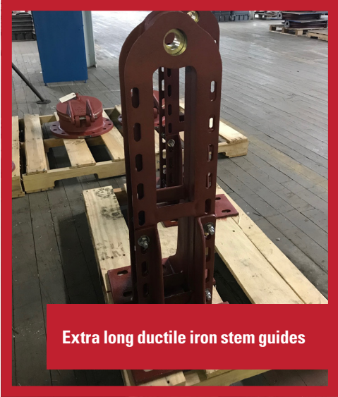
Extra long ductile iron stem guides