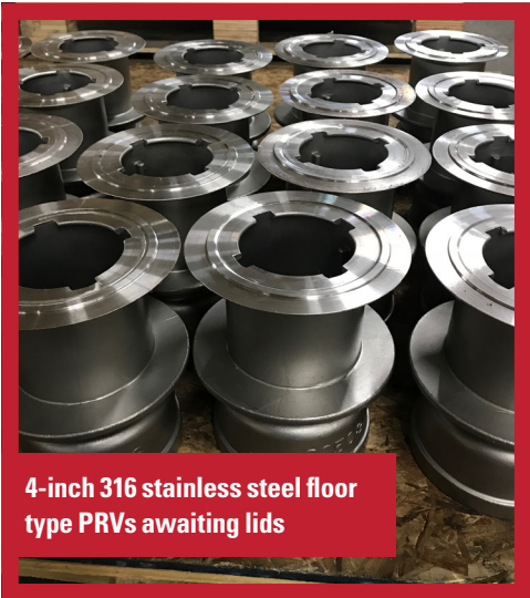
4-inch 316 stainless steel floor type PRVs awaiting lids